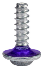
AFTER 5X INSTALLATIONS / REMOVALS