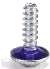
M3 BEFORE INSTALLATIONS